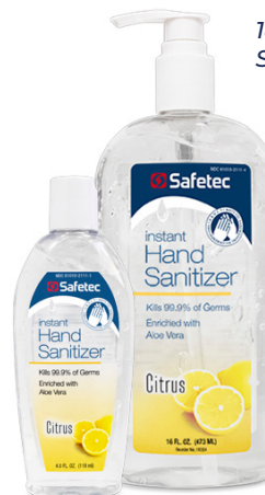
18350 & 18354 Citrus Scent Bottles Shown