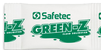
42031 Zafety Pac Shown

Help reduce handling, shipping, and compliance risks of diagnostic specimens, infectious substances, and dangerous goods by using superabsorbent Zafety Pacs. These lightweight pre-measured (single-use) small solidifier pac provide unique absorption and encapsulation properties ideal for safe compliant packaging and specimen transportation.