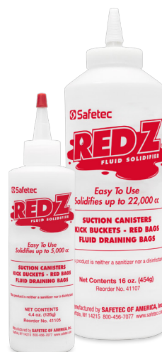
41105 & 41107 Red Z® Bottles Shown