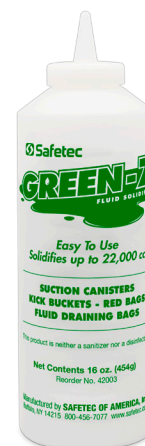
42003 Green-Z® Bottle Shown